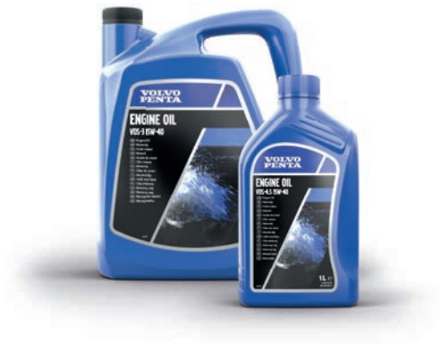
ENGINE OILS PAGE 5

Note! The products displayed in this catalogue are not available in the US.